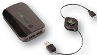
Retrak 6,000 mAh Power Bank with Retractable Micro USB Cable

PLUS, GET YOUR CHOICE OF A FREE GIFT WHEN YOU OPEN ANY NEW CHECKING ACCOUNT!