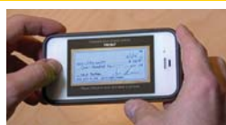
Mobile Banking with Check Deposit